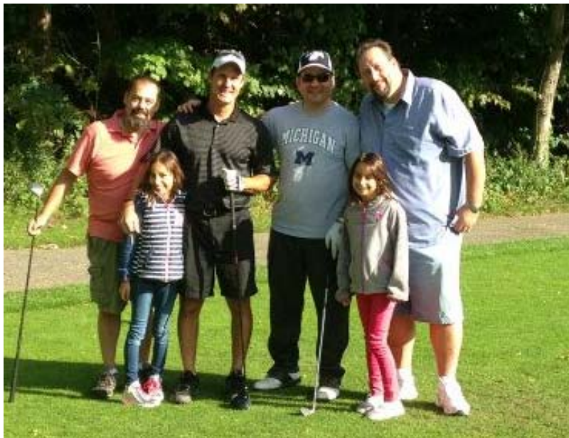
Golfers enjoying the good weather and good company!