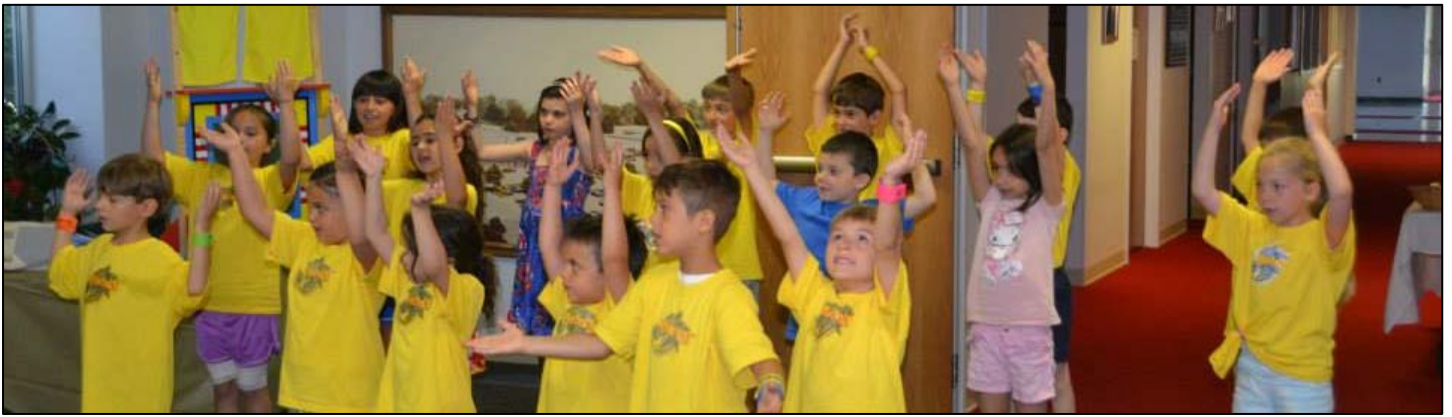
Vacation Church School students participate in a music lesson.